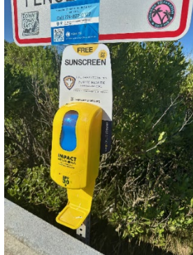
West Island, Fairhaven