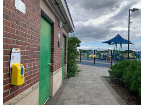
Noah's Place Playground, Pope's Island