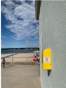
West Beach, New Bedford

SEMA Public Health’s community sunscreen dispensers are accessible during the summer months in key locations across New Bedford, Fairhaven, and Acushnet and provide free SPF 30, reef-safe, sport sunscreen to community members. An additional mobile sunscreen dispenser unit is brought to SEMA outreach events during the spring and summer months.