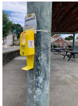
Monte Park, New Bedford