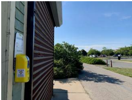
Fort Taber, New Bedford